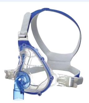
Comfortable, 3-strap, set-and-forget headgear: easy and quick to fit; distributes pressure evenly across the head; skin-friendly materials enhance comfort.

Quick-release headgear clips allow easy removal of the mask from the headgear without disturbing the patient